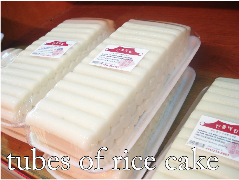
tubes of rice cake