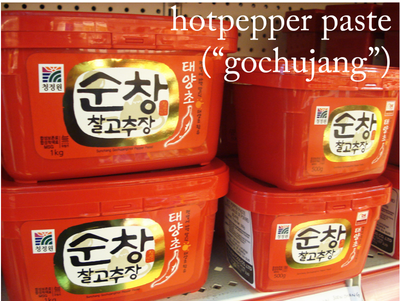
hotpepper paste ("gochujang")

see http://www.maangchi.com/recipes/ddukbokie for video, comments, and help